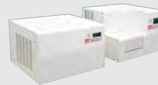
AC-2S series Atmospheric Photoemission Yield Spectrometers