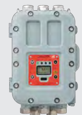
FI-900 Optical Interferometric Gas Monitor with Flame-proof Enclosure