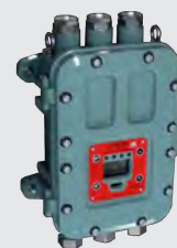
OHC-800 Explosion-proof Calorimeter