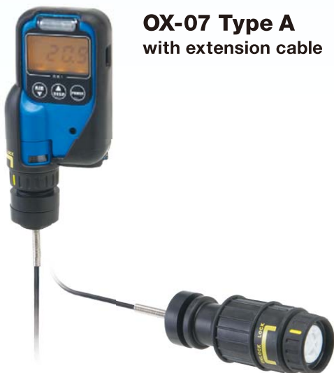
OX-07 Type A with extension cable